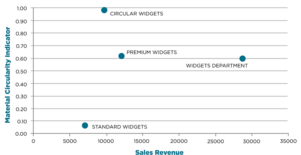
Figure 1: Combining the widget ranges

The Flange Department only contains one product range for which Sue chooses a reference product, so the MCI of this department equals that of this product. Sue uses her product level tool to compute the Material Circularity Indicator of the reference flange as 0.57 .